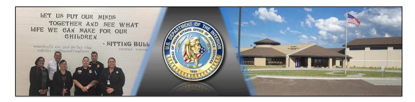
Officers and others standing together(left), IA Office of Justice Services seal (center), and grey OJS building with US flag in the foreground (right).

IA is responsible for providing Detention/Corrections services or funding to approximately 227 Tribes. Of those, 39 Tribes have compacted or contracted detention center services and BIA directly operates detention centers that serve roughly 21 Tribes. The detention needs of the remaining 167 Tribes are handled via "direct service", whereby IA funds commercial contracts with local county or Tribal facilities to house Tribal inmates. The FY 2023 request includes additional funding to support the operational needs of Indian Country detention and corrections programs. The additional resources will help cover growing personnel, equipment, and technology costs necessary to support safe and secure confinement of offenders. Also, OJS will engage in further consultation with Tribes affected by the McGirt decision to ensure the additional resources requested for FY 2023 are aligned to most effectively address new and evolving challenges in Indian communities throughout eastern Oklahoma.