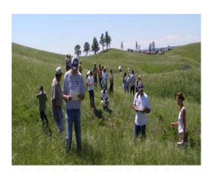
Ecological Site and Similarity Indexing Method Training, Pine Ridge SD

Agriculture Program (TPA) [+$4,500,000; FTE: +5] - The increase promotes conservation, multiple use, and sustained yield management carried out by IA personnel or by Tribes under Indian self-determination agreements. Climate change exacerbates the spread of noxious weeds and the related impacts on soil and vegetation inventories. This program promotes healthy environments and native species that are resilient to the impacts from climate change. Activities center on these principal responsibilities: inventory, programmatic and conservation planning, farm and rangeland improvement, monitoring of vegetation, recruitment and placement of