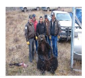
Blackfeet Tribal Game Wardens And Grizzly Management Staff in Montana

Tribal Fish & Game Projects - This program provides base funding for 26 Tribal fish and game management programs and enforcement of Tribal fish and wildlife codes through acquisition of conservation law enforcement officers. The development and enforcement of fish and game codes is the cornerstone of fish and wildlife management, and Tribal lands provide an important component of fish and wildlife habitats across the larger landscape. These funds allow Tribes to manage habitat and fish and wildlife resources while also collaborating with adjoining land managers to accomplish landscape-level management needs.