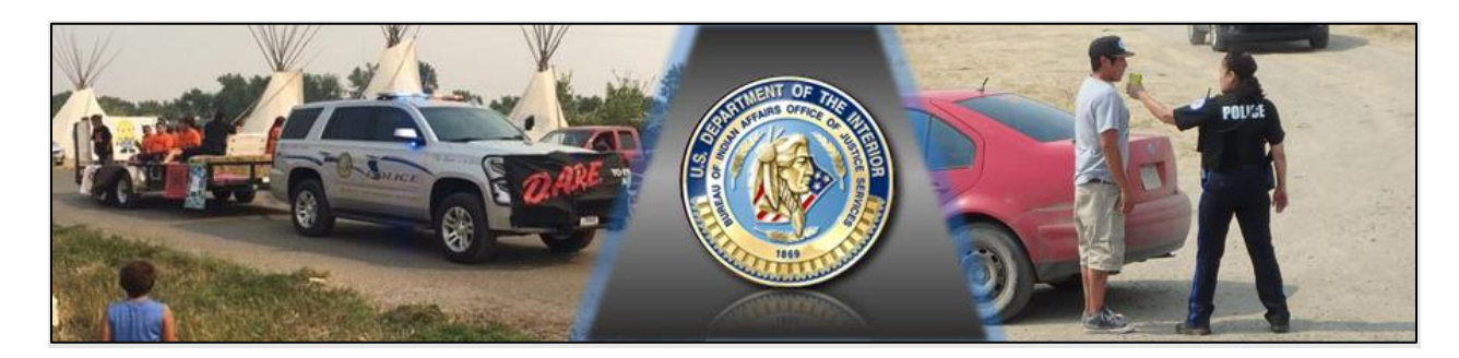
Police vehicle in a procession (left), IA Office of Justice Services seal (center), and an officer and civilian in a traffic stop (right).

The Office of Justice Services is responsible for enforcing laws and investigating crimes committed on or involving Indian Country, primarily where States lack local criminal jurisdiction. Programs address major Federal crimes as well as state crimes assimilated into Federal statutes, such as murder; manslaughter; child sexual abuse; kidnapping; rape; assault; arson; burglary; robbery; and the production, sale, or distribution of illegal drugs. In addition to investigating crimes, OJS provides oversight and technical assistance to Tribal law enforcement agencies.