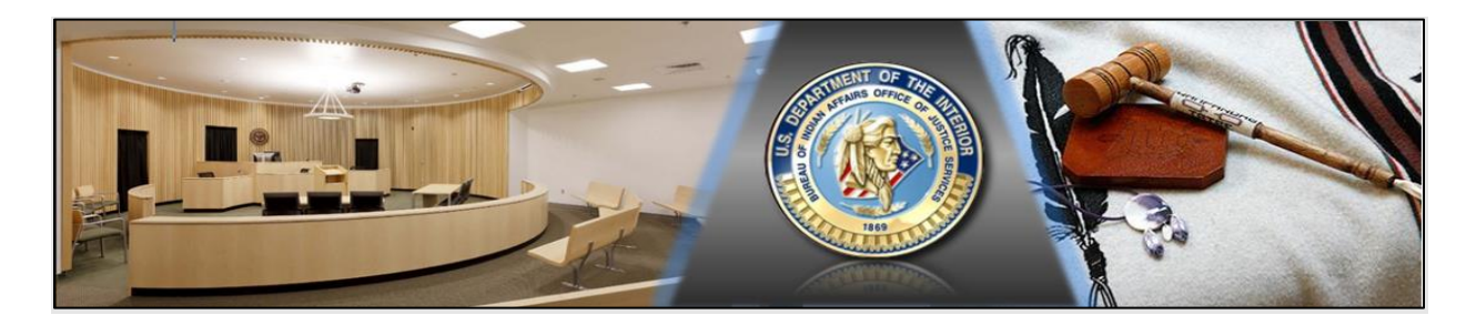
Tribal courtroom with wooden furniture (left), IA Office of Justice Services seal (center) and a wooden gavel set with Native design beside a decorative feather on a blanket (right).

The Office of Tribal Justice Support (TJS) is a vital contributor to the BIA initiative to target significant and rising criminal justice issues impacting Native American communities, particularly Native women. The 2013 VAWA reauthorization included special domestic violence criminal jurisdiction provisions affecting Indian populations on reservations which has had a significant impact on Tribal justice systems. To ensure compliance with provisions contained in VAWA, IA conducts training for direct service program staff in the areas of law enforcement, social services, victim services, and courts, as well as provides additional technical assistance and training to Tribes operating these programs under Pub.L. 93-638 contracts and compacts, and assists Tribes in updating their codes to reflect provisions in the VAWA Reauthorization as they "opt in."