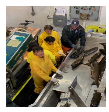
Yakama Tribal hatchery facilities, Tribal youth assist with the work and contribute in many areas of research in streams and river projects on the reservations.

Columbia River Inter-Tribal Fish Commission (CRITFC) - CRITFC, formed in 1977, is recognized as a global leader in protecting and restoring treaty-based fisheries and implementing cost-effective management strategies. CRITFC is committed to the comprehensive management plan, Wy-Kan-Ush-Mi Wa-Kish-Wit "The Spirit of the Salmon" oriented to these long-term goals: restore anadromous fishes to the rivers and streams that support the historical, cultural, and economic practices of the Tribes; emphasize strategies that rely on