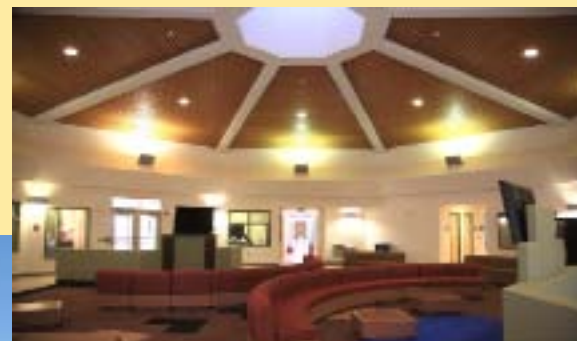
Ch'osgai Community School dorm, Arizona