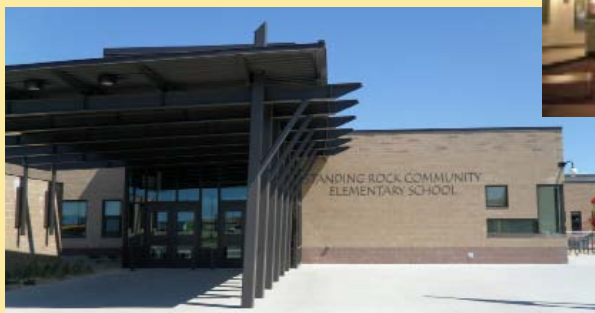
Standing Rock Elementary School, North Dakota

The most active year ever for the Office of Facilities Management and Construction (OFMC) saw six replacement schools, five replacement facilities and three Facilities Improvement & Repair projects completed in FY2010. The facilities will serve nearly 3,800 Indian students in six states, with some construction projects proceeding from gold shovel ground breaking to ribbon cutting opening in just over one year.