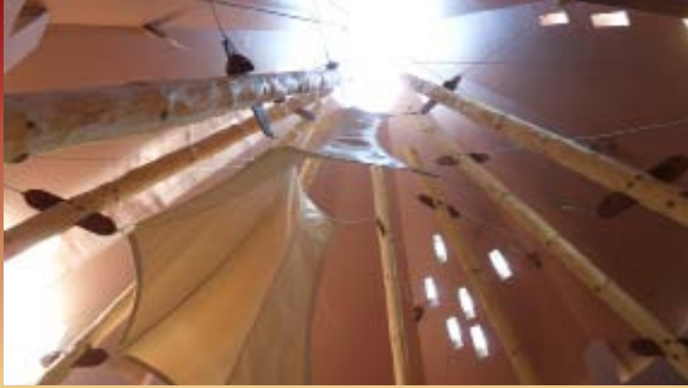
Daylight streams through the skylight in the rotunda of Standing Rock Elementary School in North Dakota. The small, exterior openings in the upper portion of the rotunda allows the sunlight to project star constellations onto the interior wall surface and stretched fabric. For example, the Bear's Lodge constellation, culturally associated with the Bear's Lodge land form and the Summer Solstice, will project on the fabric each June 21st.