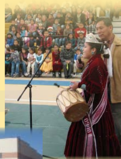
Dedication December 2009

With these completed projects and with the completion of 110 OFMC projects funded by the American Recovery and Reinvestment Act of 2009, the number of Indian Affairs schools listed in "poor" condition in FMIS will be lowered to 63. In FY2001, 120 of 183 Bureau of Indian Education schools and residential dormitories were in poor condition.