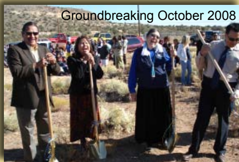
Groundbreaking October 2008

Six replacement school projects originated from the FY2004 replacement school list printed in the Federal Register, while the other Facilities Improvement & Repair and replacement facility projects stemmed from priority ranking in the Facilities Management Information System (FMIS) backlog database.