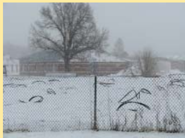
Tubes linking the ground source heat pump wells next to the new Pine Ridge School dormitory in South Dakota emerge through a spring 2009 snow.