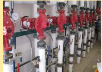
A central pump control area at Pueblo Pintado School in New Mexico sends a water/glycol mixture from underground to classroom heat pumps.