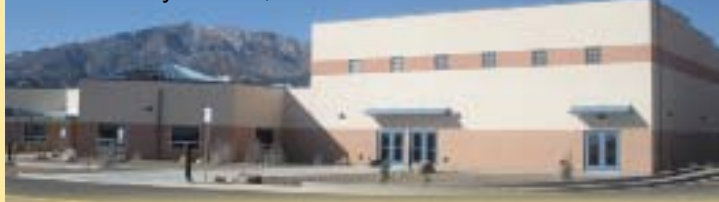
Beclabito Day School, New Mexico