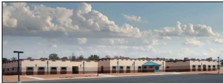
Arizona's Shonto Charter High School (not an Indian Affairs school) is a recent example of permanent, accelerated design and construction which reflects Navajo culture.

With an eye to completing replacement school projects faster and at a lower cost, OFMC is utilizing permanent, accelerated design and construction techniques for two of its current replacement school projects: Kaibeto Boarding Schools in Arizona and the Riverside Indian School replacement dormitory in Oklahoma. The use of permanent, accelerated design and construction