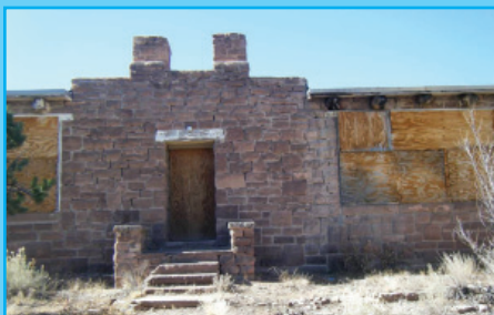
Building 401 is an example of stone structures on the Hunters Point Boarding School campus. It was built in 1935.

OFMC and the Navajo Nation Historic Preservation Office signed a memorandum of understanding this year which will ensure that a replacement Education Building containing a library, classrooms and staff offices at Hunters Point Boarding School in Arizona maintains the visual impact and stylings of historic buildings on the campus. The agreement is in line with the OFMC School Facilities Design Handbook which states that visual aesthetic is an important element of design.