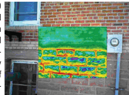
An infrared photo of the foundation of the Flandreau Indian School administration building in South Dakota shows heat leaking through the mortar.

Both the 15.7 percent decline in energy use and 10.7 percent decline in water use exceeded the Indian Affairs FY 2009 goals of a 12 percent drop in energy use and 4 percent drop in water use (compared to baseline). Intensity means British thermal unit (Btu) or water gallon per gross square foot per year. The water intensity baseline was established using a per capita daily water usage of 125 gallons per day per student, based on a school year of 180 days. Only 30 percent of Indian Affairs locations are metered for water. Meanwhile, many existing Indian Affairs buildings will be getting new electrical meters in FY 2010. The performance improvements were due in part to water and energy conservation measures undertaken as part of FI&R projects and alternative energy generation for existing facilities. Indian Affairs generated roughly 49 MWH of renewable energy on federal and trust lands during FY 2009.