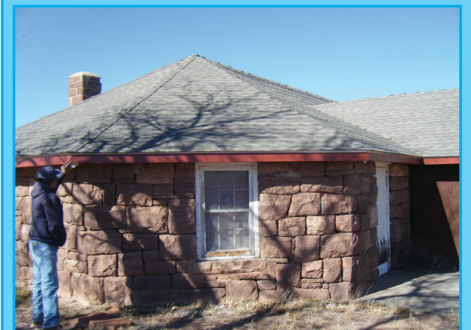
This restored hogan at Hunters Point was originally built in 1935.

The memorandum of agreement addresses future construction on the Hunters Point campus: OFMC and the Navajo Nation will work together during pre-planning and planning phases for the design of any future buildings to ensure that their visual impact reflects the stylings of the campus' historic structures.