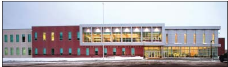
Turtle Mountain High School is Indian Affairs' first LEED Silver Certified school

The 126,000 square foot day school, which opened in 2008, was constructed for 572 students who are mostly members of the Turtle Mountain Chippewa Tribe. The school is operated by the Bureau of Indian Education. During its design and construction, the project successfully earned 33 project points/credits, as determined by the USGBC, toward a LEED Silver Certificate. For example, the school was designed to optimize energy performance and daylight views, enhance alternative