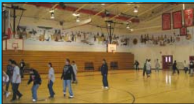
The new mural encircles part of the Pine Ridge gym.