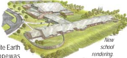
New school rendering.