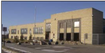
Current Circle of Life Survival School.

The Circle of Life Survival School replacement campus near White Earth, Minn., is nearing construction. The 56,000 square foot school for 96 students in grades K-12 is situated on the northern bank of Mission Lake. The 8.4 acre site of the former St.