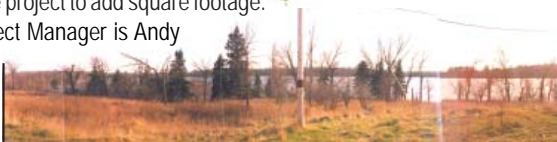
New school site on Mission Lake.