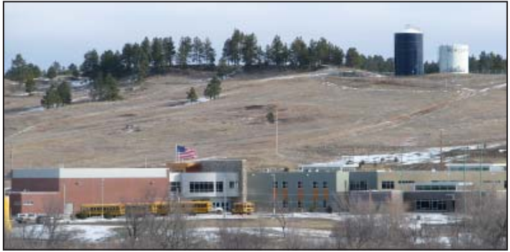
Porcupine Day School on the Pine Ridge Reservation in South Dakota formally opened in February.

In another action, OFMC is publishing pre- continued on Page 7