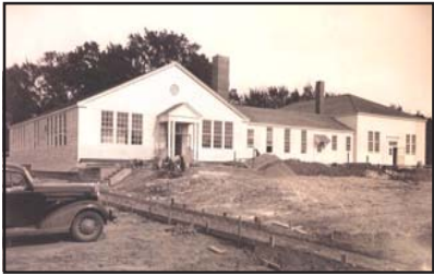
A 1937 photograph shows the Meskwaki School building under construction.