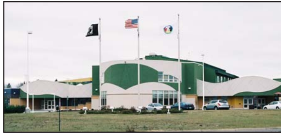
Fond du Lac Ojibwe School is designed to resemble a turtle.

The BIA's Employee Housing Repair program, with an inventory of 3,584 housing units (over 5 million square feet of space), will operate on a $1.9 million budget in FY2007. Eighty-two percent of the Bureau's employee housing inventory (2,946 units) are in fair to poor condition. They will require repair or renovation to provide employees with suitable and safe housing.