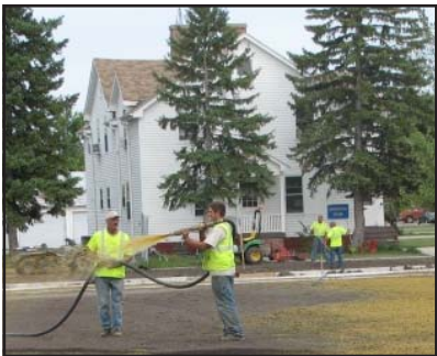
Replacement School construction begins near the current Wahpeton administration building which will be demolished.

Planning for Replacement School construction often prompts tribal leaders and Indian school officials to make difficult, yet heartfelt, decisions regarding the disposition of long-standing school buildings. At Circle of Nations - Wahpeton Indian Boarding School in Wahpeton, N.D., and at Meskwaki Settlement School in Tama, Iowa, these older buildings were the center of education activities for decades. Realistic analysis showed tribal leaders that while there is some emotional significance to the buildings, preservation and transfer of ownership were not economically feasible for the tribe. That was the case with a wooden frame building which had served as the centerpiece of the Meskwaki campus since 1937. It will be scheduled for demolition upon the signing of a Sept. 19, 2006, memorandum of understanding between the Bureau and the tribe.