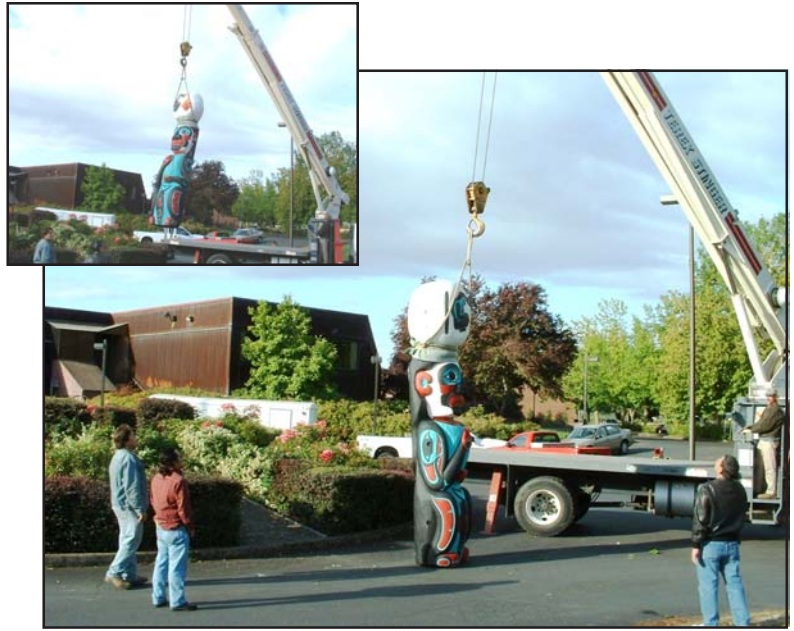
Weighing an estimated 2,500 pounds, the "Indian in the Moon" totem pole is lifted into place in September 2006 by the Chemawa Indian School facilities staff. The next day, tribal leaders from throughout the Northwest gathered at the BIA boarding school to dedicate the artwork.