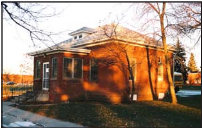
A 2004 photograph of the original administration building at Wahpeton.