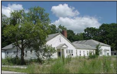
The Meskwaki School building in 2005.