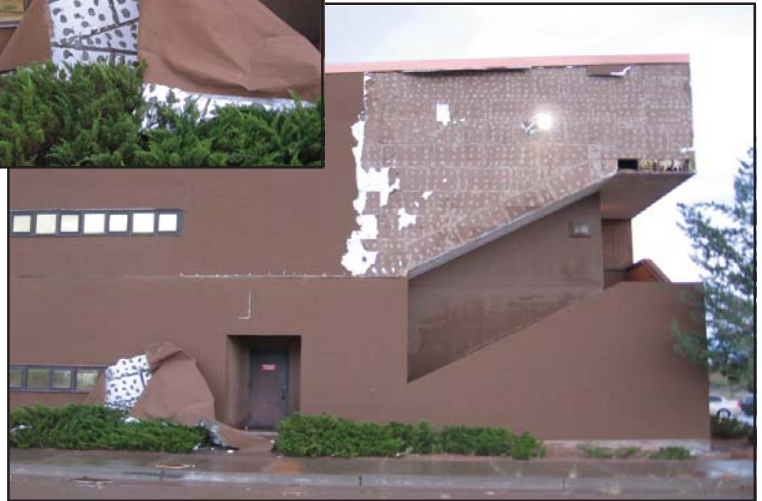
Cottonwood trees near the Tuba City Boarding School (right) fell victim to a wind storm that struck Tuba City, Ariz., in January. The storm also caused damage to the facade of the Tuba City Agency building (above). No injuries were reported at the BIA sites.