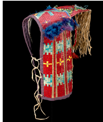
Lakota model baby carrier with porcupine-quill embroidery, North or South Dakota, ca. 1880. Photo by Walter Larrimore, NMAI. (12/2308)

You might also think about how you can attract customers to your physical store location. Consult with your state's tourism office by either viewing its website, or by e-mailing or calling, to determine if there are any tours suggested for visitors and whether your business can be listed as a stop on the agenda. To attract tourists to your shop, you can host open studio days where they can witness an artist at work creating a painting or particular craft and giving them the option to purchase that product or others in the store following the demonstration.