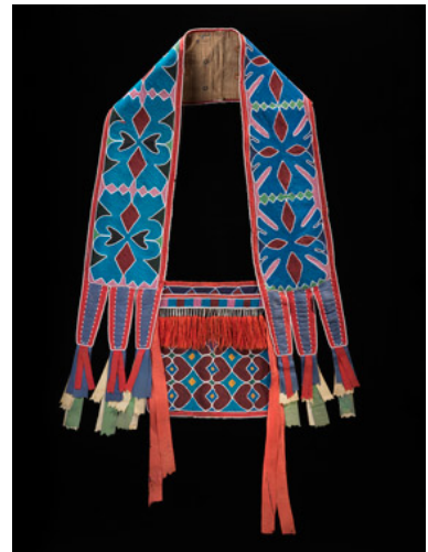
Shoulder bag/bandolier bag (probably Oklahoma Delaware). (21/3358)

After answering all of these questions, you should be able to determine the price at which you will sell your product to ensure it is worth your time to create the product and that you are turning a profit on each product you sell.