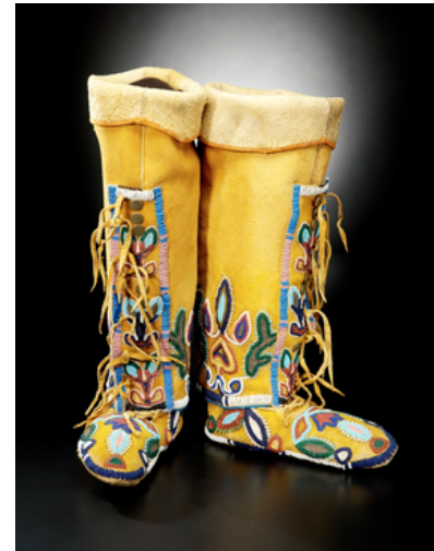
Northern Shoshone woman’s leggings and moccasins, ca. 1910. (12/3197, 12/3213)