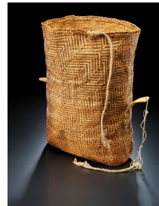
Burden basket/pack basket (probably Gitlaktamix Nisga'a). (01/4280)